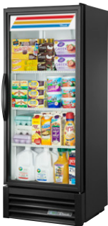
Standard Black Exterior