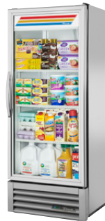
Optional Stainless Exterior