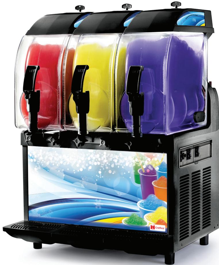
model I-PRO 3M with light panel