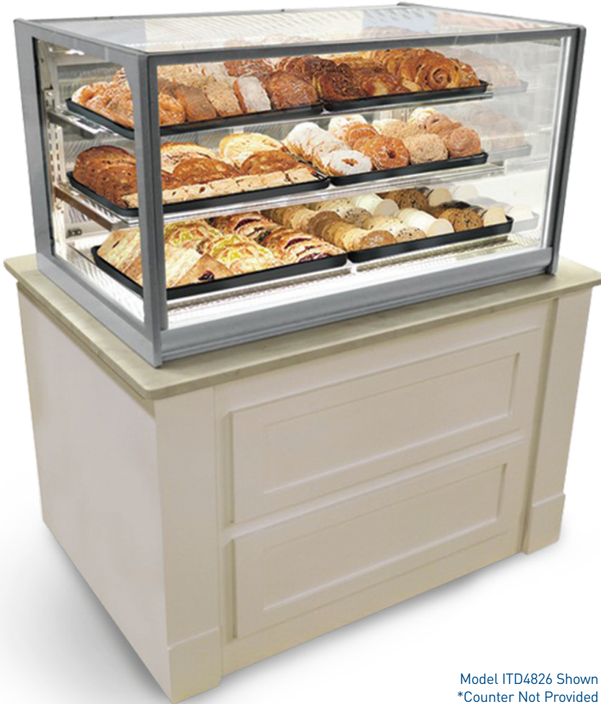
Model ITD4826 Shown *Counter Not Provided

Designed for customers looking for rich, up-scale Italian styling for maximum visual appeal that will drive product sales.