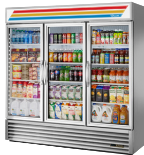
Optional Stainless Exterior