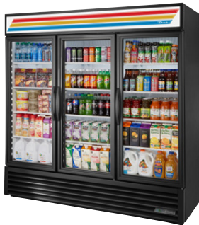
Standard Black Exterior