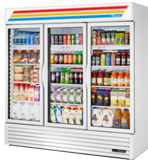
Optional White Exterior