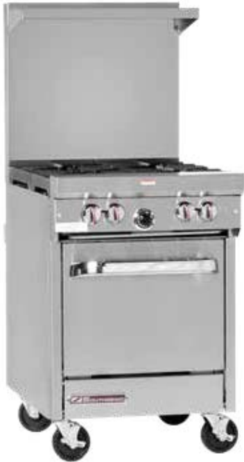
S24E (shown with optional casters)