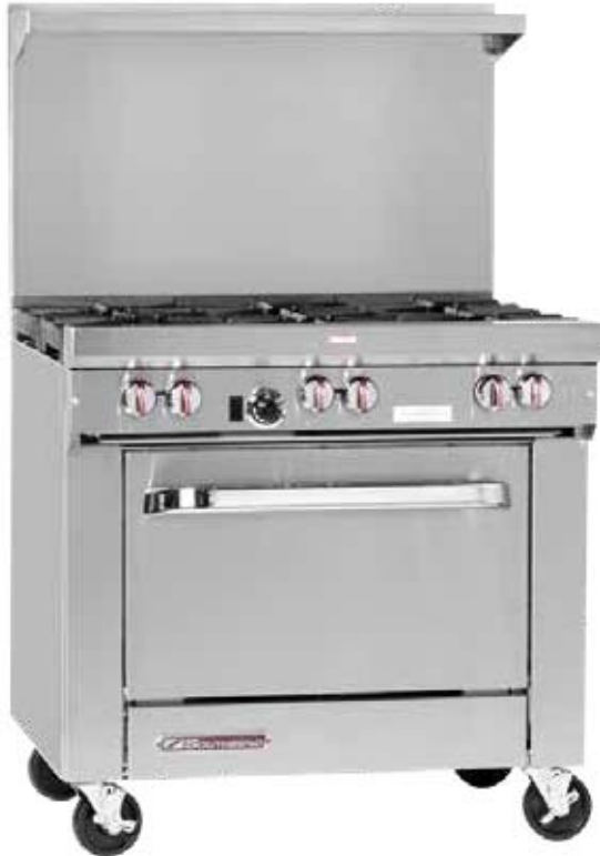
S36D (shown with optional casters)